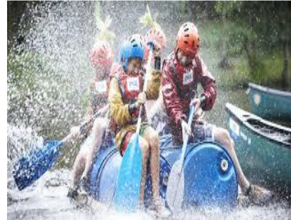
PGL Year 6 Funds Spent: £400