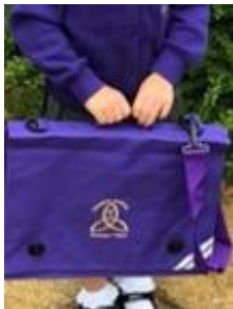
Book Bags for new Reception Funds Spent: £454.50