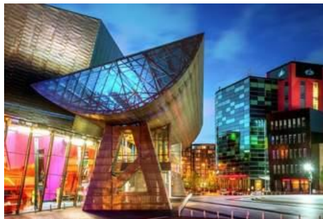
Lowry Theatre Trip Funds Spent: £550