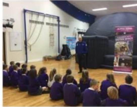
Planetarium Year 5 Funds Spent: £300