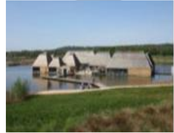
Brockholes Nature Reserve Funds Spent: £365