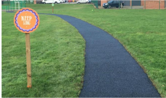
Daily Mile Track Unity Place Funds Spent £10,000